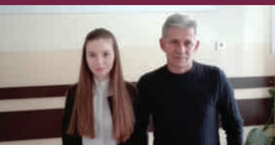
Zamość, Poland II Liceum Ogólnokształcące im. Marii Konopnickiej