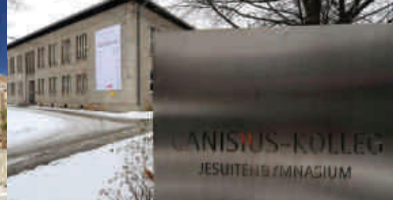
Berlin, Germany Canisius-Kolleg Berlin