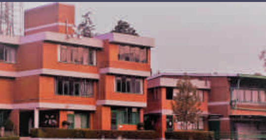
Mexico City, Mexico Greengates School