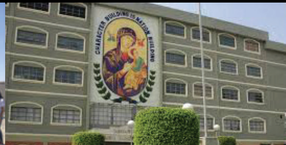
Biñan, Philippines University of Perpetual Help System Laguna