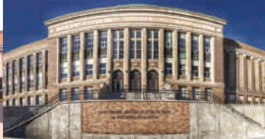
Kitchener, Canada Kitchener-Waterloo Collegiate and Vocation Institute