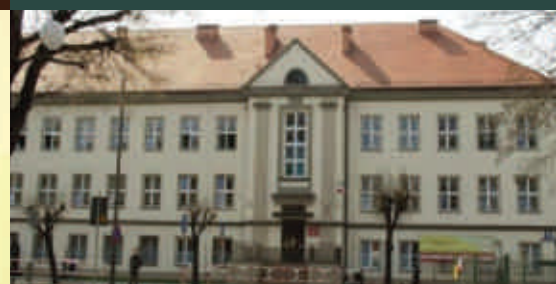
Wieluń, Poland II Liceum Ogólnokształcące im. Januszka Korczaka