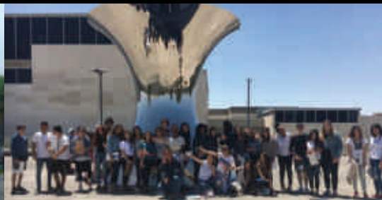
Haifa, Israel Beit Biram – The Hebrew Reali High School