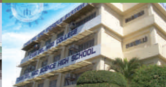
San Pedro City, Philippines Casa Del Niño Montessori & Science High School