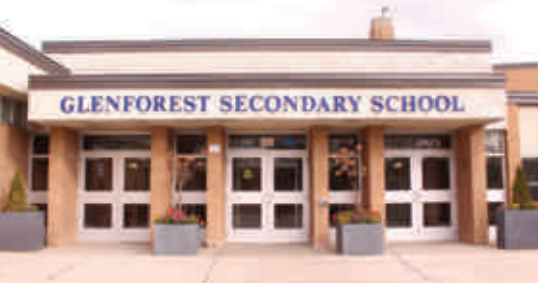
Mississauga, Canada Glenforest Secondary School