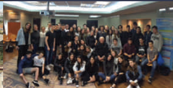
Tel Aviv, Israel Amal Lady Davis High School

We proudly welcome students and educators from these registered international schools to the 19 th Annual Holocaust Art and Writing Contest.