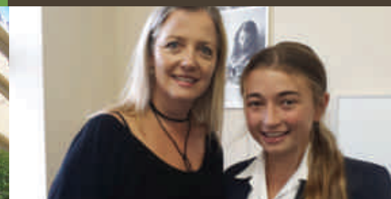
Johannesburg, South Africa St. Stithians Girls College