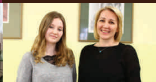
Mińsku Mazowiecki, Poland Gimnazjum i Liceum Ogólnokształcące im. Polskiej Macierzy Szkolnej