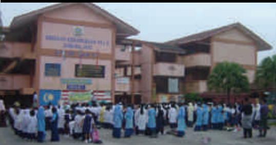
Subans Jaya, Malaysia Seafield National High School

We proudly welcome students and educators from these registered international schools to the 19 th Annual Holocaust Art and Writing Contest.