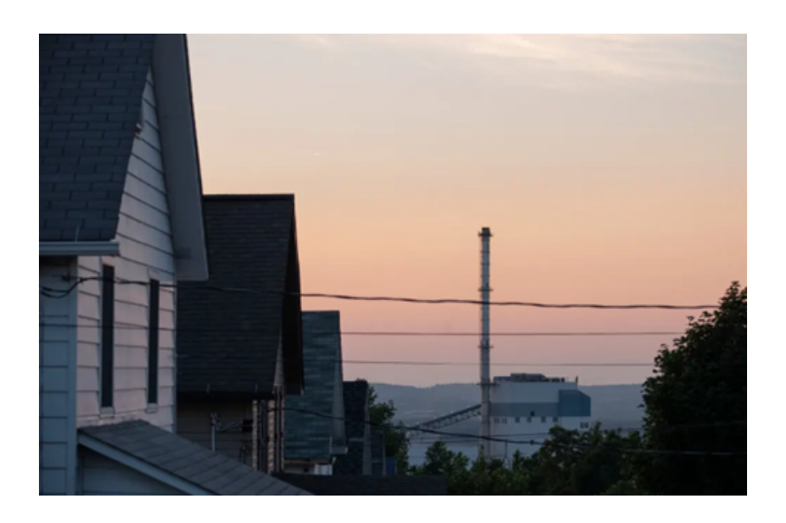
EPA to Tighten Limits on Mercury and Other Pollutants from Power Plants

The recent Inflation Reduction Act includes multiple climate change provisions that have encouraged companies and developers to find more sustainable alternatives that will help lower carbon dioxide emissions. As a result, some developers have worked on ambitious projects that turn corn into ethanol and soybeans into biodiesel for transportation fuel.