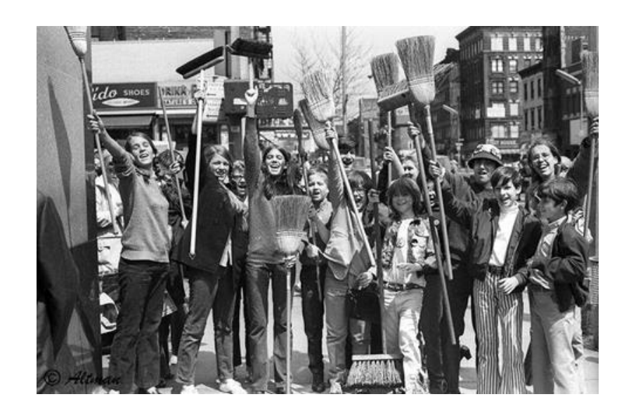
50 years of Earth Day: What's Better Today, and What's Worse?

Take a look at the evolution of Earth Day, with both the environmental victories and failures that have impacted American priorities towards ecological justice-- lots has changed. With the large push for the protection of endangered animals, many at-risk species have grown in numbers, such as the bald eagle. Yet still, deforestation and habitat