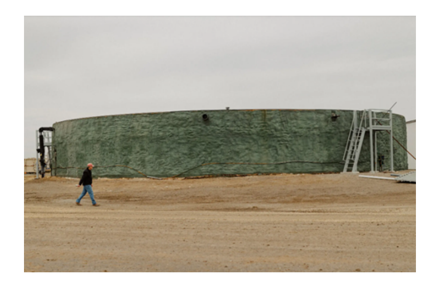
A Push to Turn Farm Waste Into Fuel

destruction caused by the oil, logging, farming, and mining industries has led to an estimated 60% decline in thousands of wildlife populations worldwide since 1970.