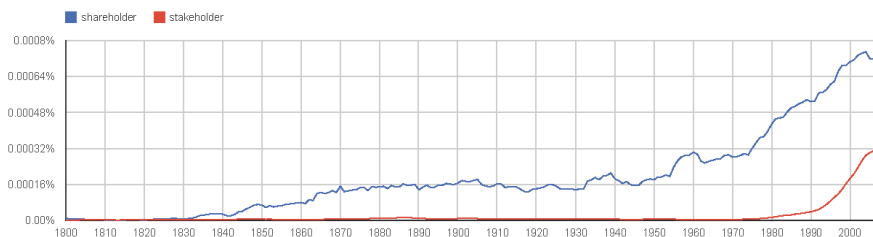
TABLE 2: GOOGLE LABS BOOKS NGRAM VIEWER GRAPH SHAREHOLDER (UPPER LINE) V. STAKEHOLDER (LOWER LINE) FROM 1800 TO 2008 FROM THE CORPUS OF ENGLISH WITH A SMOOTHING OF 3