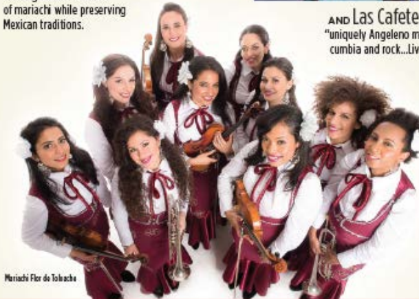
Mariachi Flor de Toloache

Pushing the boundaries of mariachi while preserving Mexican traditions.