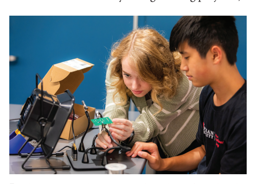
Chapman students assisted students from local middle and high schools, who learned how to build their own remote-controlled cars.

The students learned about 3D modeling and printing, assembling electronic components, and coding to complete projects that include a custom-engraved LED-powered light and an Arduino-controlled toy car. (Arduino is a type of inexpensive microcontroller board that can be customized for a variety of engineering projects.)