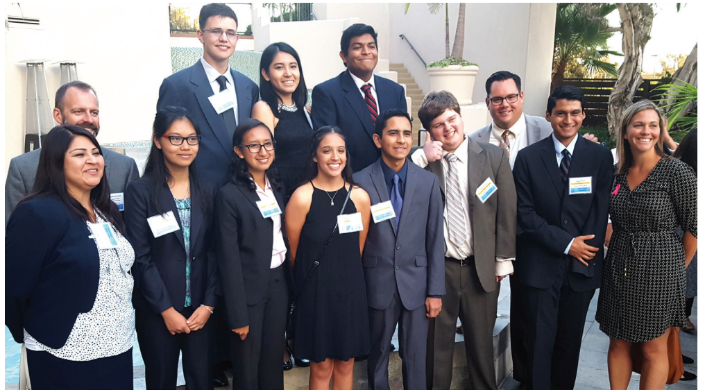
Simon STEM Scholars from Orange High School and teachers gather together at a recent banquet held in their honor.

The program is a six-year process that begins during a student's junior year at Orange High School and continues through four years at Chapman University. While still in high school, the selected students receive a computer, academic support and college level research experience. The