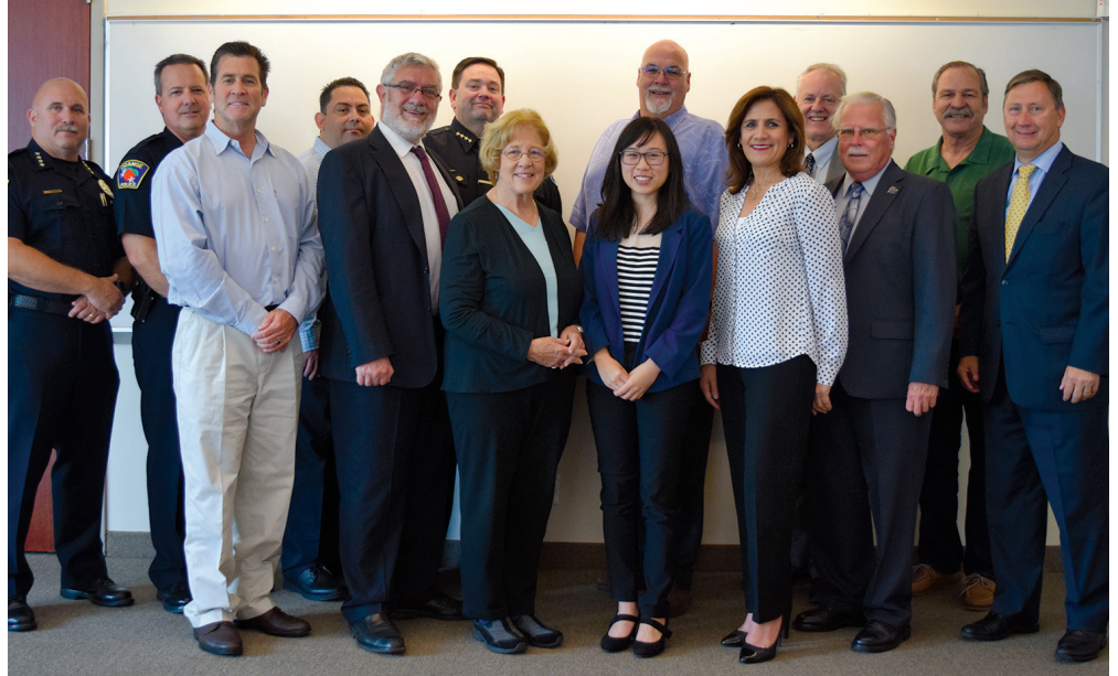
Members of the Neighborhood Advisory Committee gathered for their first meeting on April 26.