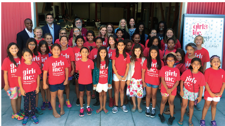
Young entrepreneurs from Girls Inc. visit Chapman during summer 2016. This year’s camp will be housed at Chapman University.