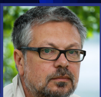
April 3 Mikhail Shishkin