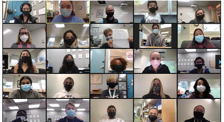
Participants in the Chapman Writing Project with Santiago Charter Middle School celebrated in a virtual publishing party in November 2021.